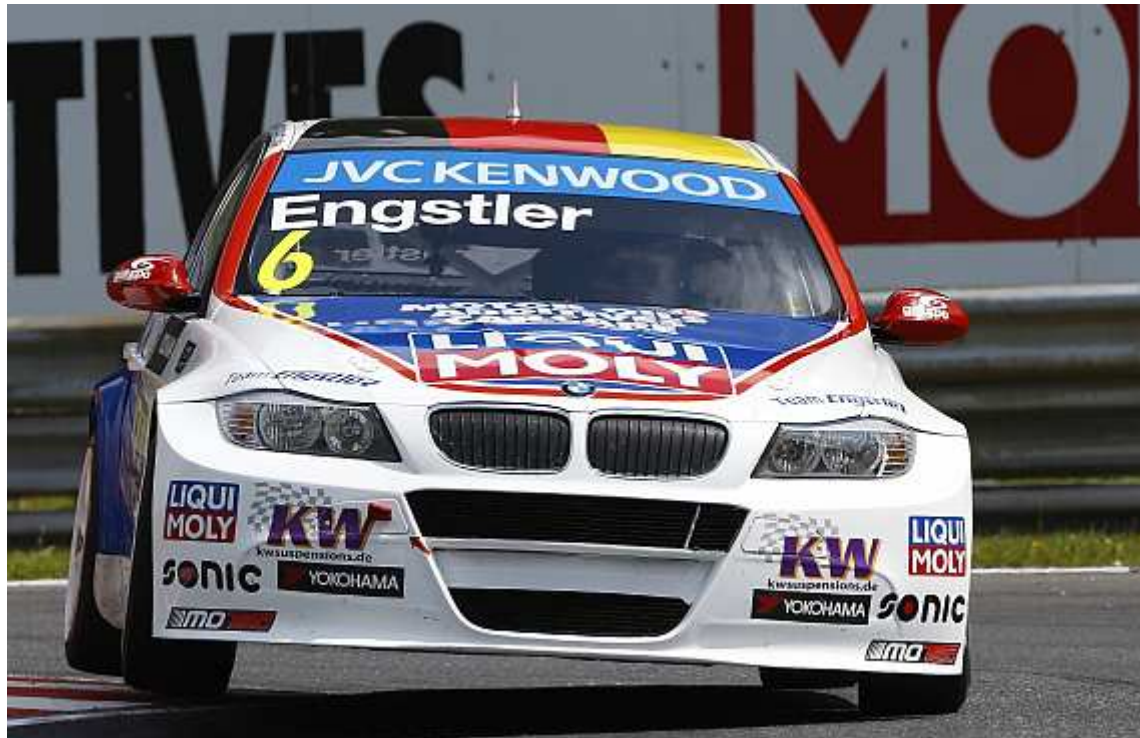
WTCC BMW E90, TC

History: WTCC 2014 winning car of independent championship